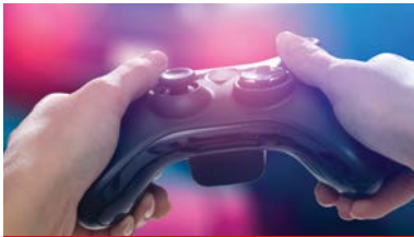
Wearable & Gaming